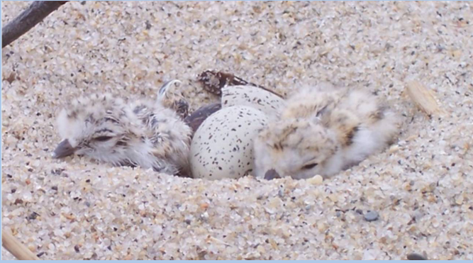
Piping Plover Chicks