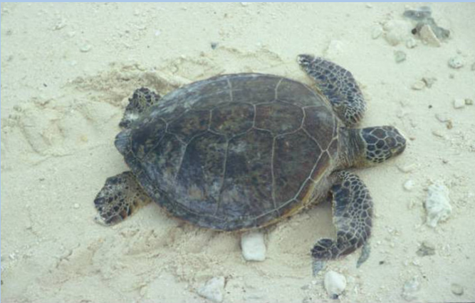
Green Turtle

and the Superintendent's Compendium 2007, as well as elements from the 1978 draft interim ORV Management Plan that were incorporated in Superintendent's Order 07.