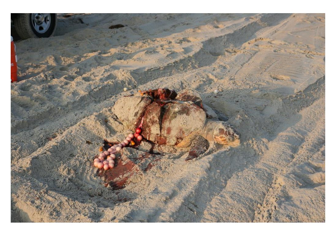
NPS photo of scene showing turtle carcass (between ORV tracks) and drag marks. Oval objects extruding from the turtle are eggs.