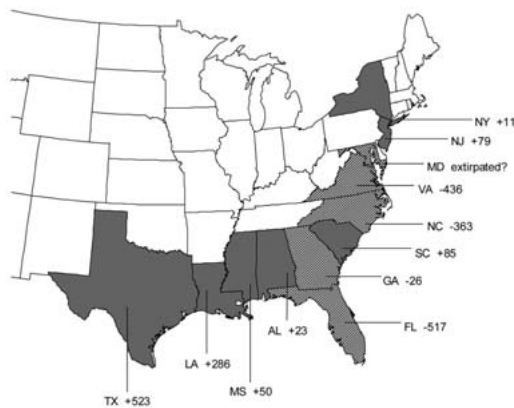
Figure 3. Apparent trends of reported numbers of breeding pairs of aranea Gull-billed Terns in states on the Atlantic and Gulf of Mexico coasts from state-wide censuses conducted between the 1970s and 2000s. The trend for Georgia was calculated using the 1995 census, the first statewide census available. States with population increases are shown with solid shading; those with decreases shown with diagonal hatching.

nested (Grinnell and Miller 1944). The decline continued through the 1950s and 1960s with 60 pairs in 1952, 75 pairs in 1957, 40-50 pairs in 1959 and just a few pairs through the 1960s (Remsen 1978). By 1976 only 17 pairs nested (McCaskie 1976) and “perhaps twice this number may have nested in 1977” (Remsen 1978: p. 18). During the 1980s the largest