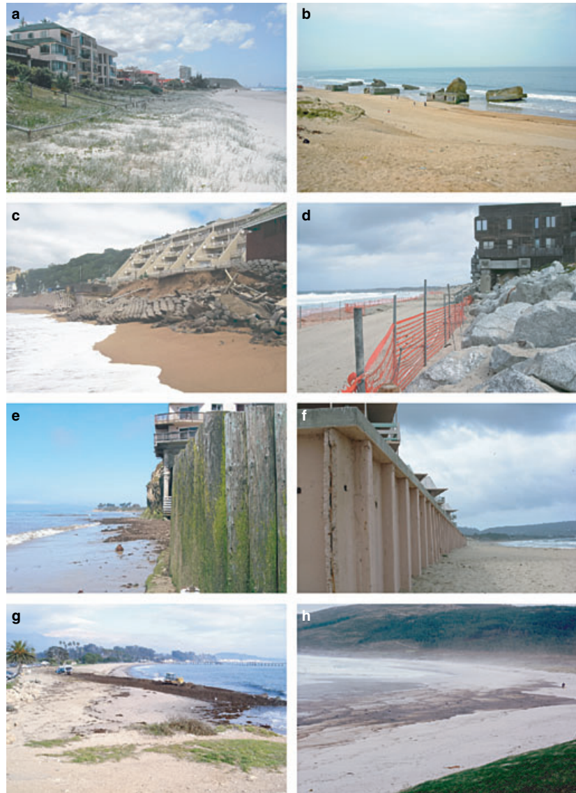
Fig. 3. Beach erosion threatening human infrastructure, management responses to shoreline instability and oil pollution. a: buildings located in ecologically sensitive dune areas and located too close to dynamic shoreline position (Eastern Australia); b–d: shoreline erosion can destroy (b – SW-France) or severely threaten (c – South Africa, d – California) the viability of human infrastructure on sandy coasts; e–g: human interventions to combat shoreline erosion include ecologically harmful engineering solutions such as seawalls (e,f – California) and beach nourishment (g – California); h: oil spills can have dramatic ecological effects on sandy shores (h – Galicia, Spain after the sinking of the ‘Prestige’ in 2002).