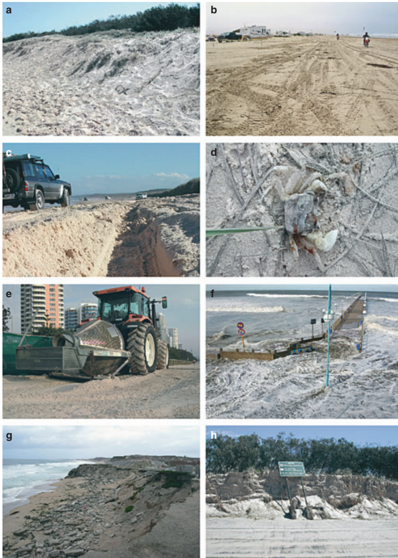
Fig. 2. Impacts of recreational activities, beach cleaning and erosion issues. a: human trampling destroys the sensitive vegetation of foredunes (Eastern Australia); b,c: use of off-road vehicles is generally not compatible with conservation of ecological features of beaches and can kill invertebrates (b – California, c – Eastern Australia, d – ghost crab Ocypode ceratophthalma crushed by 4WD vehicle, Eastern Australia); e: beach raking removes organic material that normally supports invertebrate consumers and may slow formation of embryo dunes (Eastern Australia); f,g,h: high seas (f) causing beach erosion (h) compounded by human modifications (g) of natural dune systems (f – South Africa, g – California, h – Eastern Australia).

These workshops were convened by Mariano Lastra and chaired by Alan Jones (Climate Change), Dave Schoeman (Methods) and Thomas Schlacher (Management). To facilitate communication between beach managers and ecologists, we summarise the salient features of sandy beaches as functional ecosystems in 50 'key statements'; these present the shared views of all authors of this paper and provide a succinct synopsis of the main structural and functional characteristics of these highly dynamic ecosystems.